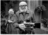
Ansel Adams and Imogen Cunningham, 1975