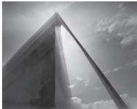
Arch, Pyramid Form, 2000