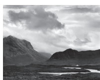
White House, Isle of Skye, 2004 SGP, 004/100, 2005 16" x 20" $950