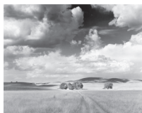
Farm and Clouds, New Mexico, 1986 SGP, 103/150, 2002 16" x 20" $2875