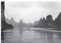
Children Wading, Li River, 1981