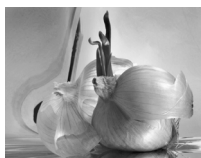
Onion, 1976 SGP, 137/150, 2011 11" x 14" $4000