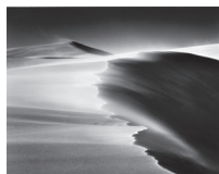
Sandstorm, White Spray, Great Sand Dunes, 1997 SGP, 007/100, 2000 16" x 20" $950