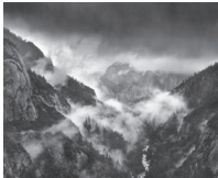
Bridalveil Fall in Storm, 1974