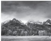
Cabin, Grand Tetons, 1975