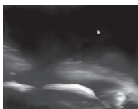
Moons and Clouds, Baniff, 1975 SGP, 032/150, 2002 16" x 20" $1175