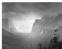
Spring Rain, Yosemite, 1984 SGP, 074/150, 2007 20" x 24" $2550