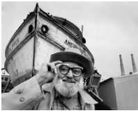
Ansel Adams and the American Clipper, 1975