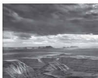
Monument Valley, Evening Clouds, 2004 SGP, 020/100, 2005 16" x 20" $950